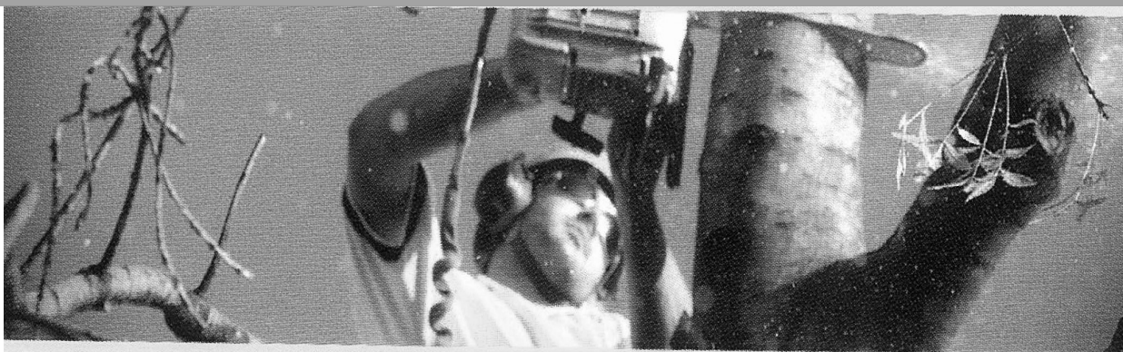
Tree Pruning and Removal, Stump Grinding, Mulching and Chipping, Arboricultural Assessments